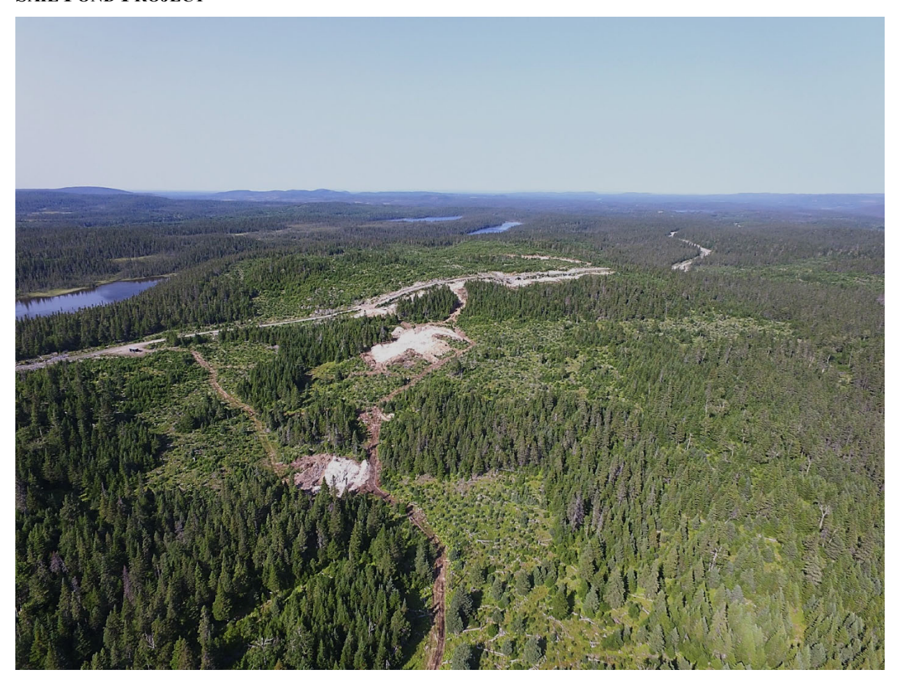
Sail Pond Project Area Viewing North from the South Mineralized Zone