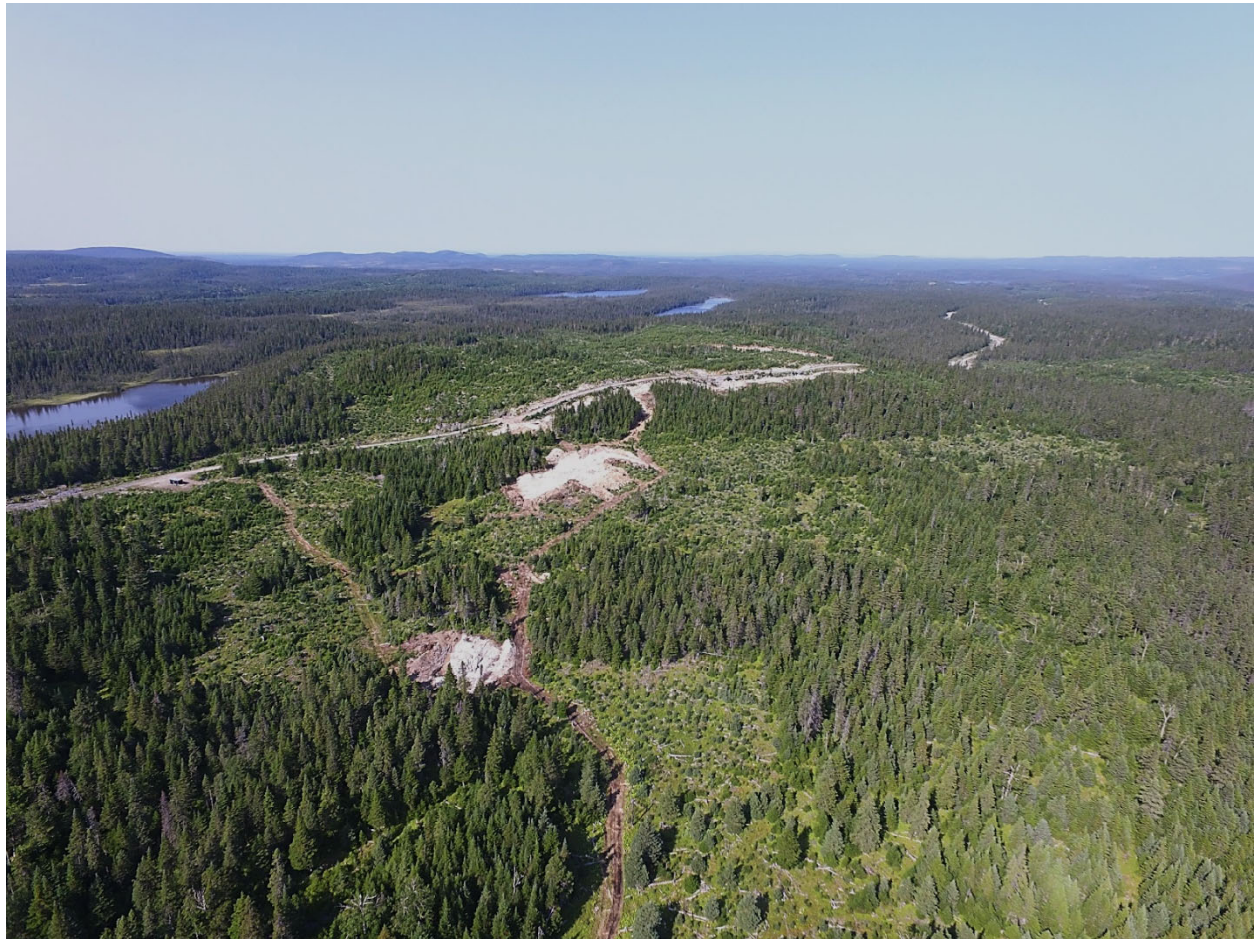
Sail Pond Project Area Viewing North from the South Mineralized Zone