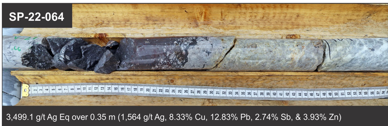
Figure 3. Massive sulphide high grade mineralization in hole SP-22-064 at depth of 183.9m