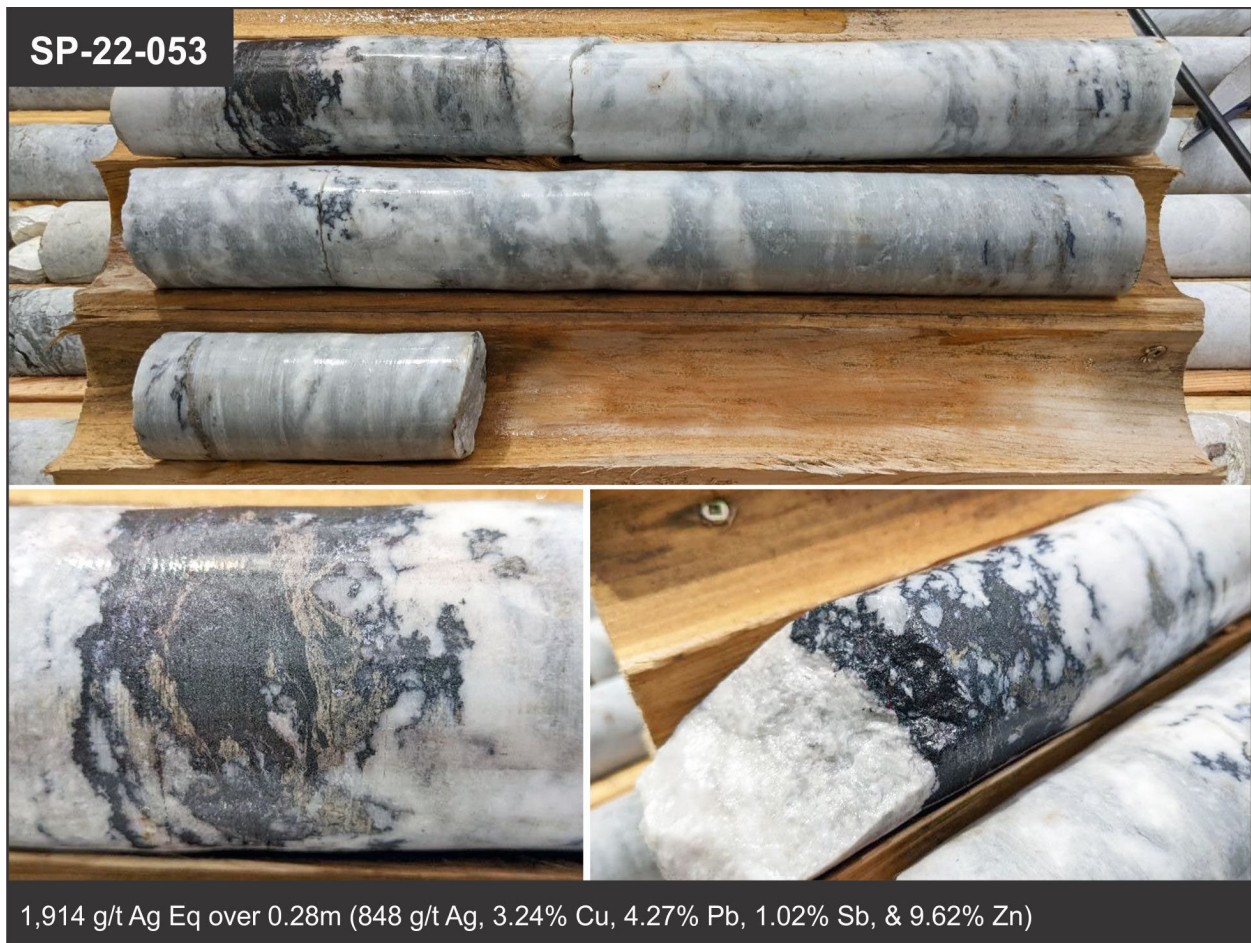
Figure 2. High grade mineralization in hole SP-22-053 from 223m to 224m