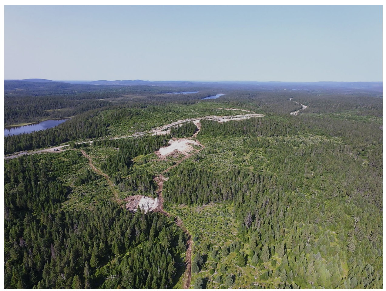
Sail Pond Project Area Viewing North from the South Mineralized Zone